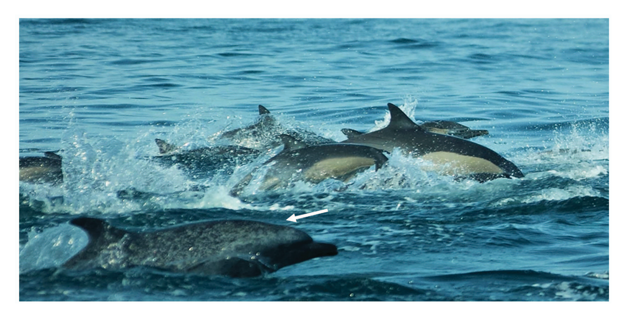
Figure 2. Sighting of the pantropical spotted dolphin (white arrow) swimming within a group of common dolphins / Avistamiento del delfín moteado pantropical (flecha blanca) nadando dentro de un grupo de delfines comunes

The second record occurred on January 7th 2018, off El Alto (04°15'26"S; 81°15'44"W), a location (ca., 17 km south of Los Organos) (Fig. 1). At 2.5 km away, at 0714 h after sighting 4 Bryde's whales (Balaenoptera brydei), a group of common dolphins was observed a short distance away. The size of the pod was estimated (ca., 1000 individuals). The common dolphins were feeding. Within this group an adult pantropical spotted dolphin showing the same behaviour was sighted. The group were observed for 8 minutes before the boat left. The third encounter occurred on September 21st 2019. At the beginning of the encounter the boat headed towards a humpback whale mother-calf pair and escort. In the middle of the encounter at 0816 h a large (ca., 1500 individuals) travelling common dolphin group was sighted, further north of Los Organos. When approaching the group was approached, and as on the previous two occasions, an adult pantropical spotted dolphin was observed within the group. Unfortunately, no photos of the pantropical spotted dolphin were taken during these two other sightings.