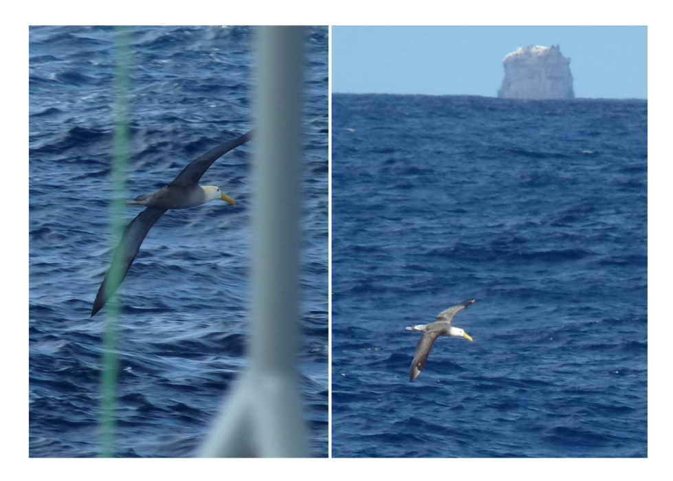
Annex 1. An adult waved albatross recorded following a swordfish longline vessel in August 2010 near to Islas Desventuradas, Chile / Adulto de albatros de Galápagos registrado siguiendo un barco de pesca de palangre pelágico para pez espada en agosto 2010, cerca de Islas Desventuradas, Chile