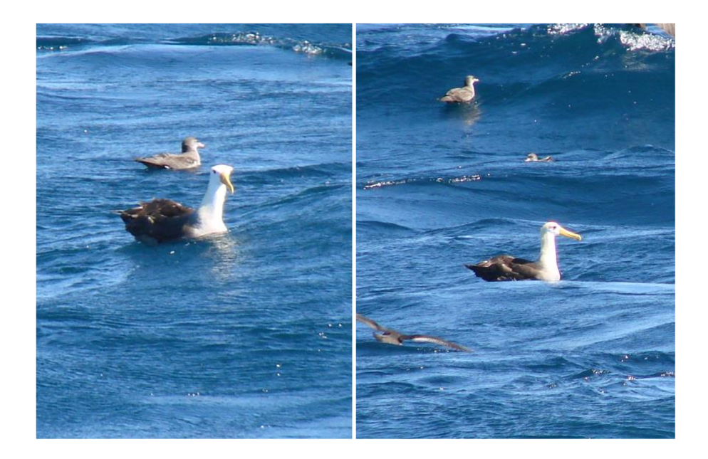
Annex 2. An adult waved albatross associated with Pink-footed shearwaters attending a trawl vessel for South Pacific hake during December 2011, north of the Isla Mocha, Chile / Adulto de albatros de Galápagos asociado con fardelas blancas asistiendo en un barco de arrastre para Merluza común durante diciembre 2011, al norte de Isla Mocha, Chile.