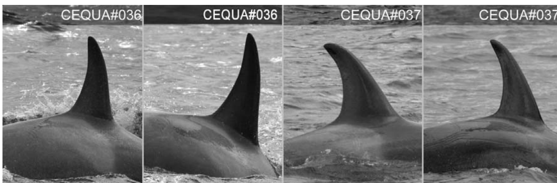
Figure 2. Photo catalogue of dorsal fins from Huinay and CEQUA/ Catálogo de foto-identificación de aletas dorsales de orcas desde Huinay y CEQUA

One killer whale (photographed on November 19, 2008) appears to have a healed cookie-cutter shark wound 5 . Cookie-cutter sharks are common outside the shelf break in warm-temperate waters, indicating killer whales may have travelled quite far equator-ward and off the Chilean coast (Dwyer & Visser 2011).