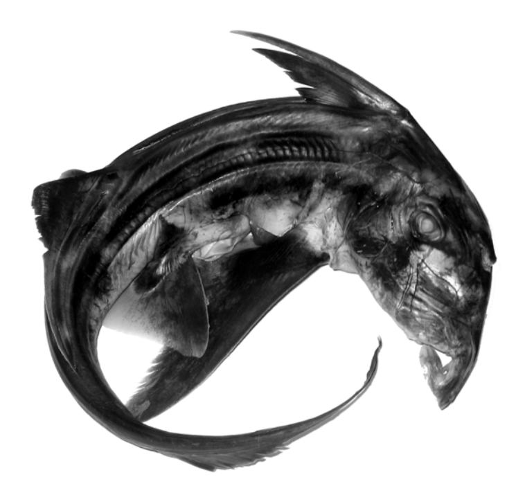
Figure 2 Callorhinchus callorynchus, 720 mm TL, Puerto López, Ecuador

Elephant fishes are commonly caught off the central coast of Chile, but only occasionally off Peru, but it should be pointed out that there is little incentive for capture since low market acceptance exists in that region (PB pers. obs.). Nonetheless, it is believed that they become very rare north of 7° S (A. Vildoso pers. com. 2005). In more southerly regions, this species regularly appears in small scale fisheries, mainly caught by gill-netting. In Puerto López, long-lines and trammel or gill nets are the main fishing devices, used between depths of 50 and 200 m. There is no deep-water trawling in the area, but shrimp trawling does occur in shallow water. Because both capture technique and depth for our specimen are undocumented, and because there is no evidence of being hooked, we must assume that it was taken in a gill net.